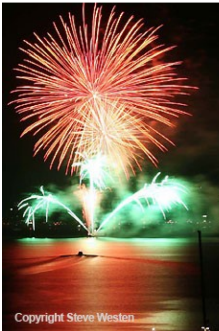
New Years Eve Fireworks Organised By Business Paihia

Please accept this welcome pack with our compliments. We extend best wishes for success in your business. We look forward to working with you to further build our vibrant business community.